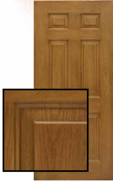
Legacy™ 20-gauge Woodgrain Textured Steel