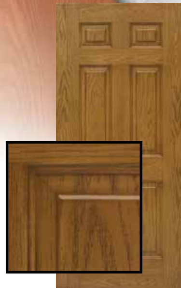
Legacy™ 22-gauge Woodgrain Textured Steel

Photos above are intended to show the variations in woodgrain texture and pattern. Swatches below are not intended for final color selection. Ask to see a Stain Selector for accurate color representation.